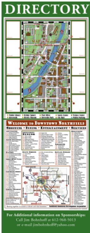
North side of Kiosk